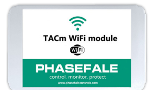
Optional WiFi module (please contact for availability)